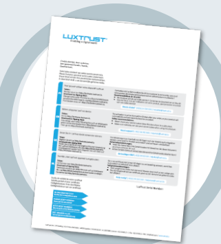
LuxTrust Codes * Initial PIN, PUK Code and Challenge received by mail (*if needed)