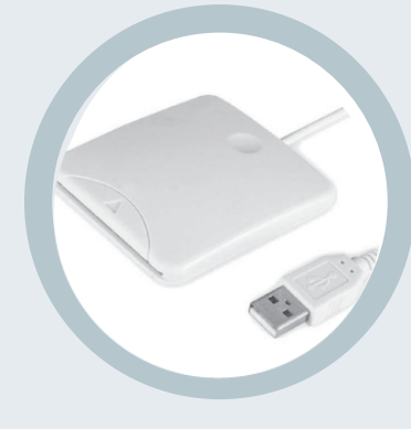
Smartcard Reader* An electronic device that reads Smartcards (external or built-in) (*if needed)