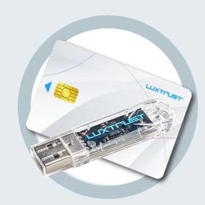
LuxTrust device Your Smartcard or your Singning Sick (with integrated chip)