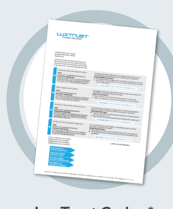
LuxTrust Codes * Initial PIN, PUK Code and Challenge received by mail (*if needed)