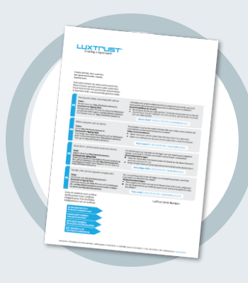
LuxTrust Codes * Initial PIN, PUK Code and Challenge received by mail (*if needed)