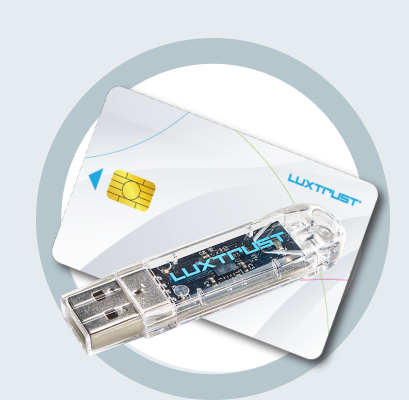
LuxTrust device Your Smartcard or your Singning Sick (with integrated chip)